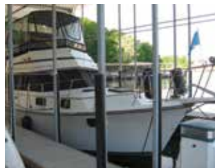
1989 Carver 36-foot Aft Cabin Motor Yacht