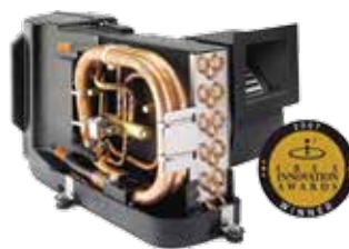
Dometic Turbo air conditioner

“What made the Turbo so appealing was that it was smaller than the old unit, yet more efficient,” explained Todd.