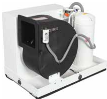
27,000 BTU/hr Compact unit shown

The Compact series of self-contained marine air conditioners offers 18,000 and 27,000, and 30,000 BTU/hr of reverse-cycle cooling and heating.