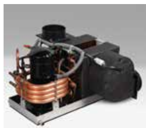
The dual-blower 30,000 BTU/hr unit with stainless-steel chassis.

The 30,000 BTU/h model features dual evaporator coils and a single compressor on a single chassis. The dual high-velocity (HV) blowers can be ducted to two or more interior spaces.