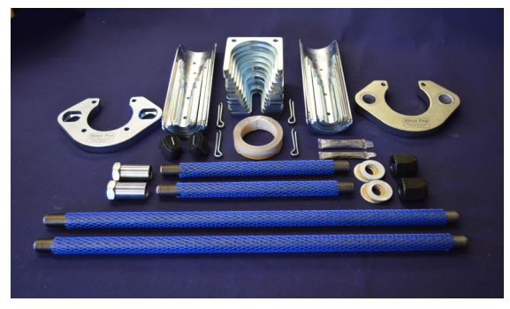
Individual and Complete Repair Yard Kits

The Standard In Affordable Damage-Free Strut Bearing Replacement.