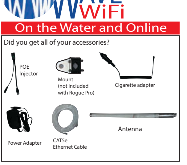
***Wave WiFi suggests Initial setup be with a Laptop.***