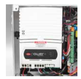
Built-in variable frequency drive.

An optional high-resolution color touchscreen provides a dynamic interface and improved system metrics and control. Access detailed, complex system information from a single location and interact accordingly.