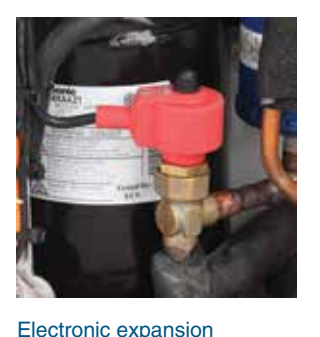
valve for precise control of superheat.