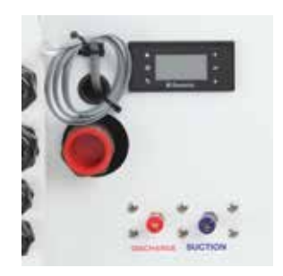
Integrated digital chiller control/display.