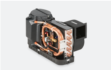
TURBO SERIES SELF-CONTAINED AIR CONDITIONER

Some restrictions apply. Offers expire 10 days after end of show. See reverse side for more information and claim form.