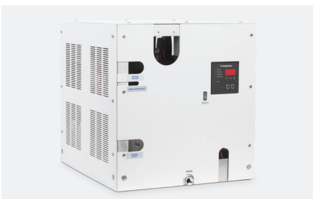
ESKIMO ICE SYSTEM EI540X WITH TITANIUM CONDENSER